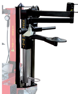
SRMini / Assist Station