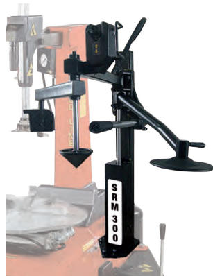
SRM300 / Assist Station