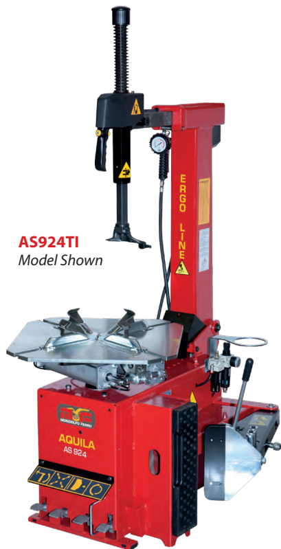
AS924TI Model Shown

AS924TI-B / Tilt Back Tire Changer With SRMini Assist Station